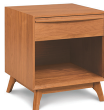
1 Drawer Nightstand 2-CAL-10-XX