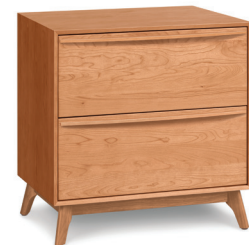
2 Drawer Nightstand 2-CAL-22-XX