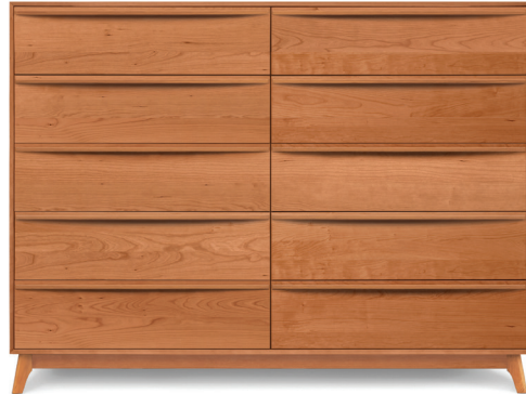
10 Drawer 2-CAL-92-XX 66 1/8"w x 18"l x 50 1/2"h