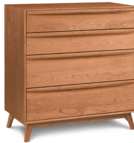
4 Drawer 2-CAL-40-XX