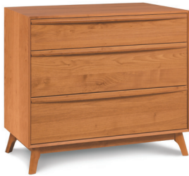
3 Drawer 2-CAL-30-XX