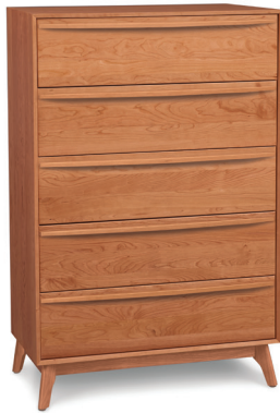
5 Drawer Wide 2-CAL-55-XX