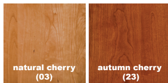
natural cherry (03)