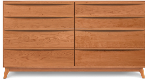
8 Drawer 2-CAL-80-XX 66 1/8"w x 18"l x 36"h