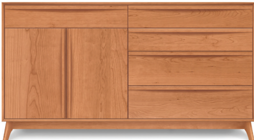
4 Drawer on Right, 1 Drawer over 2 Doors on Left Dresser 2-CAL-71-XX 66 1/8"w x 18"l x 36"h