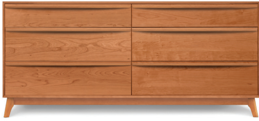
6 Drawer 2-CAL-60-XX 66 1/8"w x 18"l x 29 7/8"h