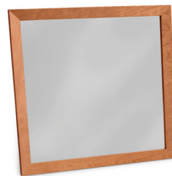
Wall Mirror 5-CAL-20-XX