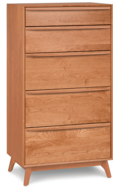
5 Drawer 2-CAL-50-XX