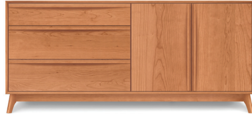
3 Drawers on Left, 2 Doors on Right Dresser 2-CAL-52-XX 66 1/8"w x 18"l x 29 7/8"h