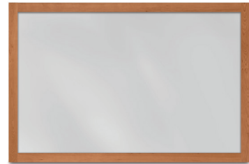
Large Wall Mirror 5-CAR-21-03